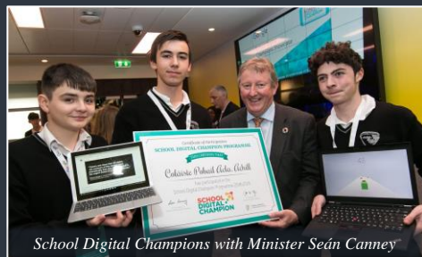
School Digital Champions with Minister Seán Canney