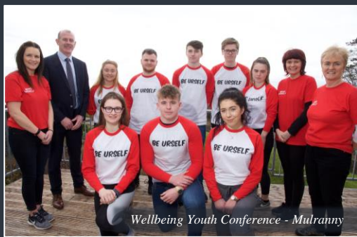
Wellbeing Youth Conference - Mulranny