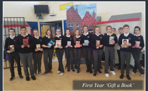
First Year 'Gift a Book'