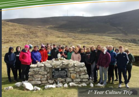
1 st Year Culture Trip

Ag obair as lámh a chéile Working together