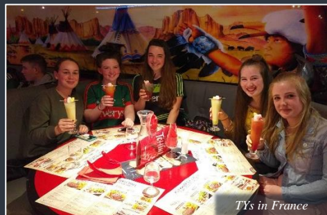
TYS in France