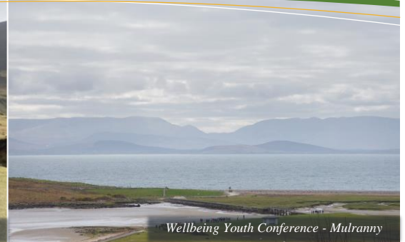
Wellbeing Youth Conference - Mulranny