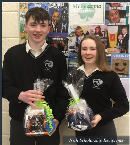
Irish Scholarship Recipients