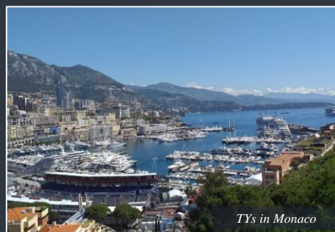
TYS in Monaco