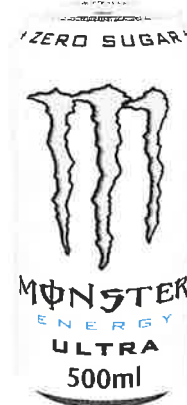
Monster 'Zero Ultra' Energy Drink 500ml Contains 150mg of caffeine per can