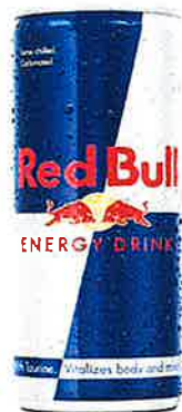
Red Bull Energy Drink 355ml can Contains 114mg of caffeine per can