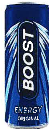
Boost Energy 250 ml can Contains 70 mg of caffeine per can