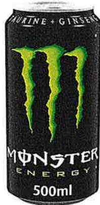
Monster Energy Drink 500ml Contains 160mg of caffeine per can