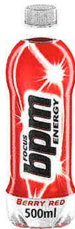
BPM Energy 500 ml bottle Contains 125 mg of caffeine per bottle