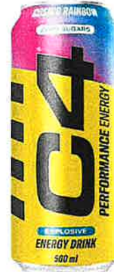
C4 Cosmic Rainbow Energy Drink 500ml Contains 160 mg of caffeine per can